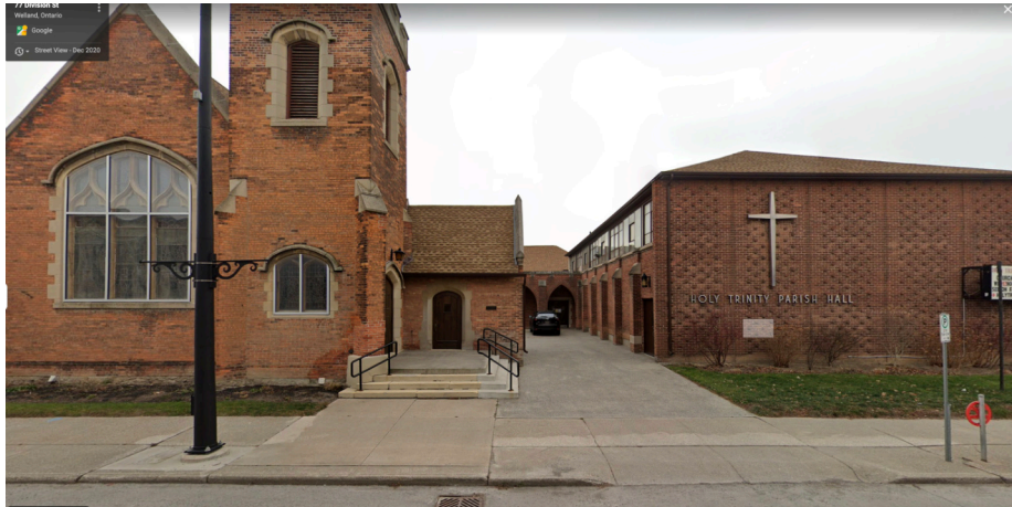
Holy Trinity Anglican Church